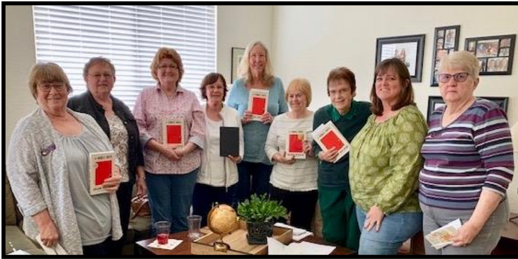
Beta Upsilon sisters held a Breakfast Book Talk, where they discussed the book "The Nickel Boy" by Colson Whitehead.